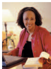
Jewell Parker Rhodes